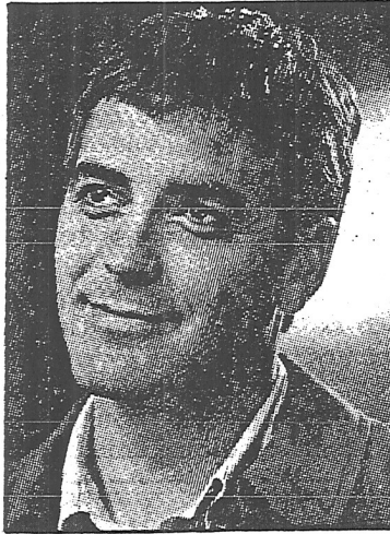
George Clooney Through with love?